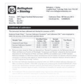
Certificate of Calibration